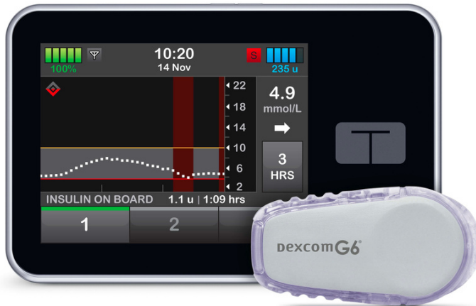
t:slim X2™ Insulin Pump